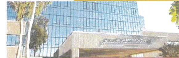
Olive View Hospital