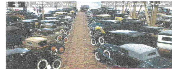
The Nethercutt Museum

Unique to the greater Los Angeles Community is Sylmar's local vibrant equestrian community, which celebrates the local hill trails surrounding Sylmar.